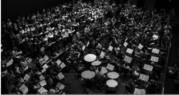
Vast forces combined for a performance of Verdi's Requiem," with two guest choruses swelling LJS&C ranks to over 300 musicians, seen here at a rehearsal.