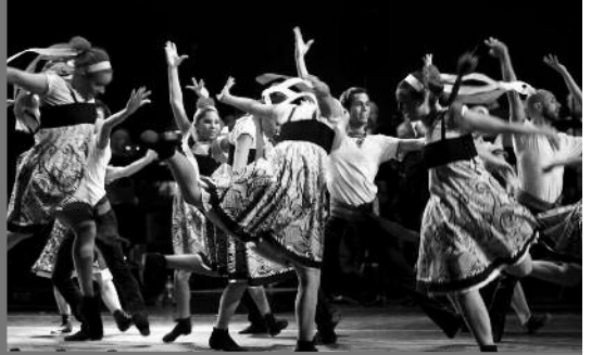
Frequent collaborators Lux Boreal set off 100 metronomes for Györgi Ligeti's "Poème Symphonique" (left photo), followed by a choreographed version of Stravinsky's "Les Noces."