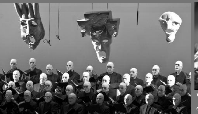
Stravinsky's "Oedipus Rex" for male chorus and soloists is given a theatrical presentation.